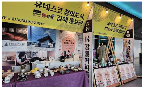
The Gangneung Coffee Festival: the exhibit and sale of Gimhae porcelainware

In April 2022, we signed an agreement with the city of Gangneung (the city recommended by the Korean National Commission for UNESCO to join the UCCN in the field of gastronomy by 2023) to work together. In October 2022, the two cities ran a joint promotional booth at each city's festival. At the Gangneung Coffee Festival, the Gimhae Ceramics Association held a pottery wheel experience event along with the exhibit and sale of porcelainware. At the Gimhae Buncheong Ceramics Festival, a free coffee sampling event and a crafts experience session were held jointly with the Gangneung Coffee Roasting Club at a leftover coffee recycling plant. It was a great opportunity for local residents of both cities to experience pottery and coffee at the same time, as they are five hours apart by car.