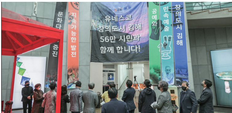
A proclamation ceremony for Gimhae's designation as a Creative City.

The city of Gimhae set out the work of establishing a creative city development plan in August 2022 to advance as a new creative city. In September 2022, the Creative City Advisory Committee was created with experts and specialists from various fields and collected expert opinions at the first meeting. In the future, the city will finalize its development plan by January 2023 by sifting through fact-finding surveys, opinion polls, interviews and forums.