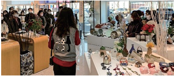
Gimhae Buncheong Ceramics Exhibition and Distribution Center