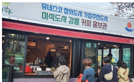
The Gimhae Buncheong Ceramics Festival: Gangneung coffee sales