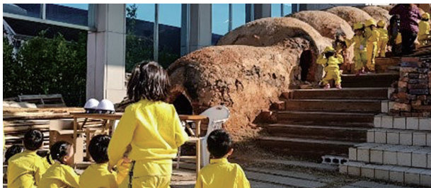
Gimhae Buncheong Ceramics Museum