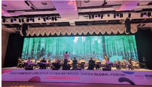
The “Gimhae City–Daegu City–Gwangju City” collaborative performance

At the Creative City International Forum held at Daegu in August 2022, the three cities including Daegu (creative city of music), Gwangju (media arts), and our city put on a show celebrating the occasion. On a stage directed by a Gwangju media artist, the Gimhae Municipal Gayageum Orchestra and the Daegu City Traditional Korean Orchestra performed together.