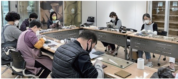
Gimhae Support Center for Small Ceramics Manufacturers

The Gimhae Buncheong Ceramics Museum opened in 2009 as Korea's first Buncheong (grayish-blue-powdered) ware exhibition hall and has been exhibiting and promoting the history and culture of Gimhae-based ceramics. In addition to displaying historical and modern Buncheong ware pieces and invitational exhibitions by local artists, we are offering a variety of programs